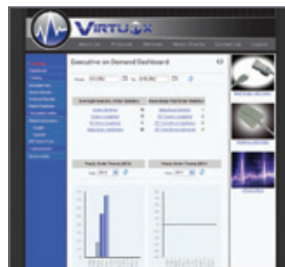
Secure, patient-specific portals